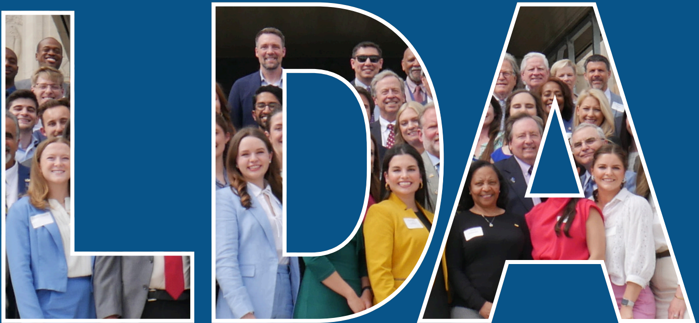
Dentists' Day at the Legislature, 2024

The Louisiana Dental Association is the largest professional health organization for dentists in Louisiana. It is a statewide grassroots organization whose purpose is to promote, advocate for, and protect the dental professional.